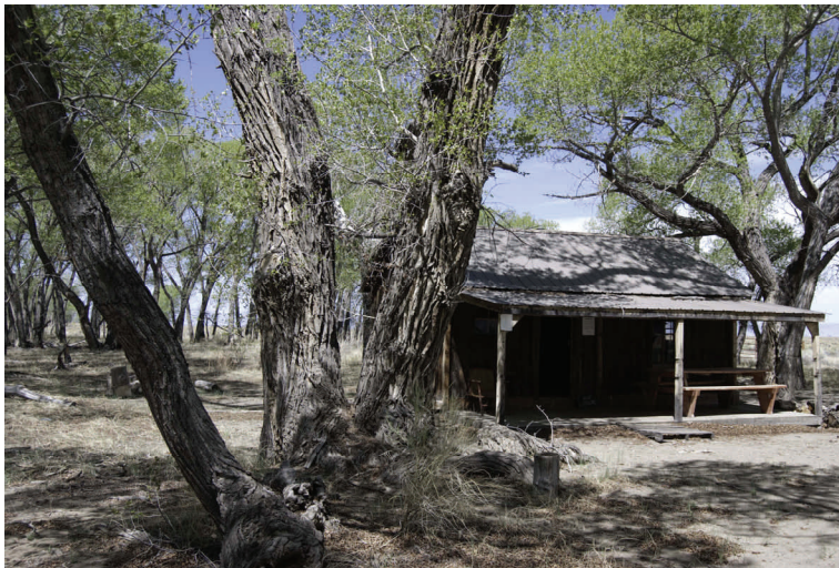
Alpine Camp, Great Sand Dunes National Park and Preserve

These suggestions attempt to mimic nature in the sense that existing relationships are utilized and waste is minimized.