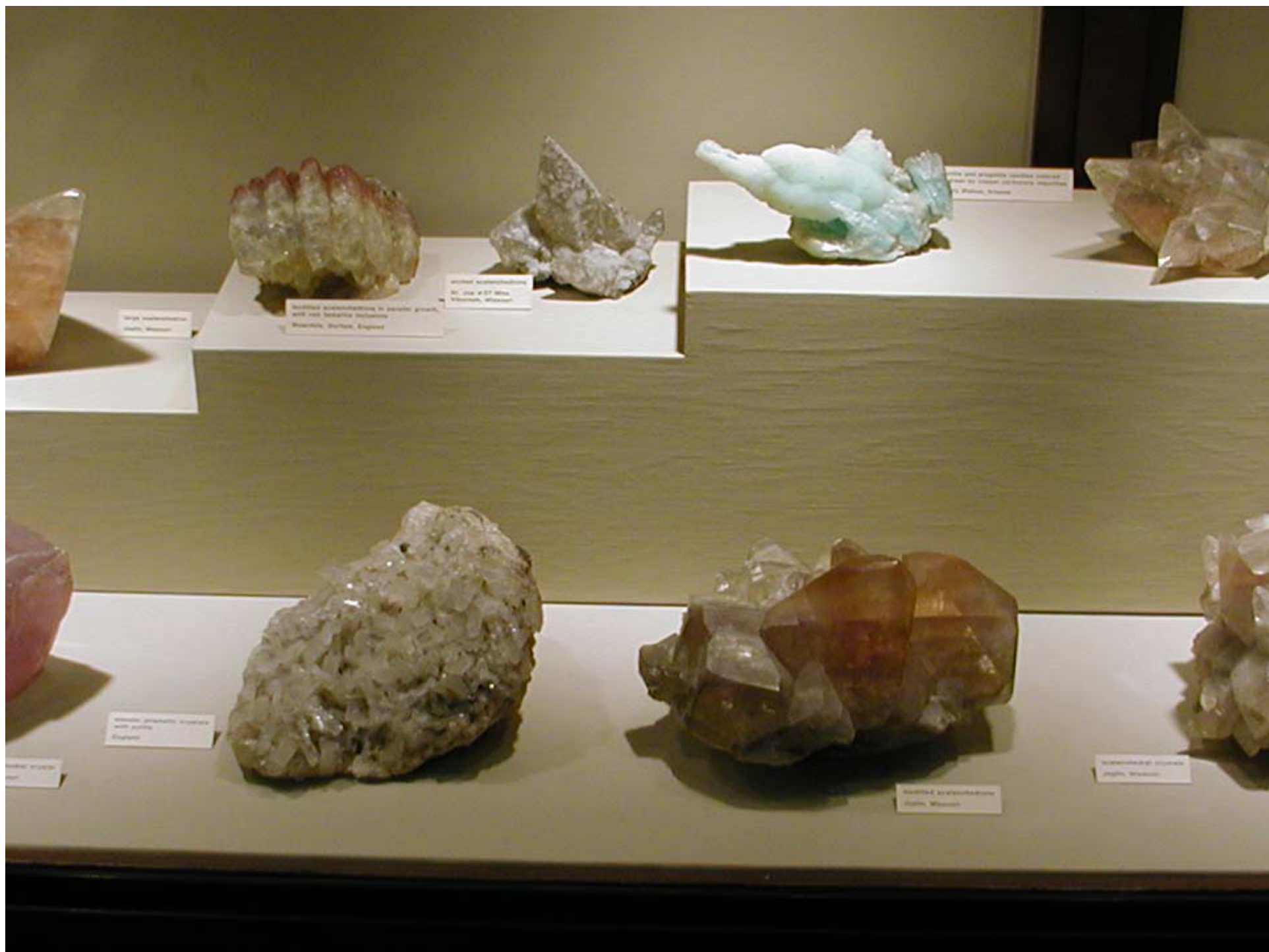
Large malachite specimen, Missouri